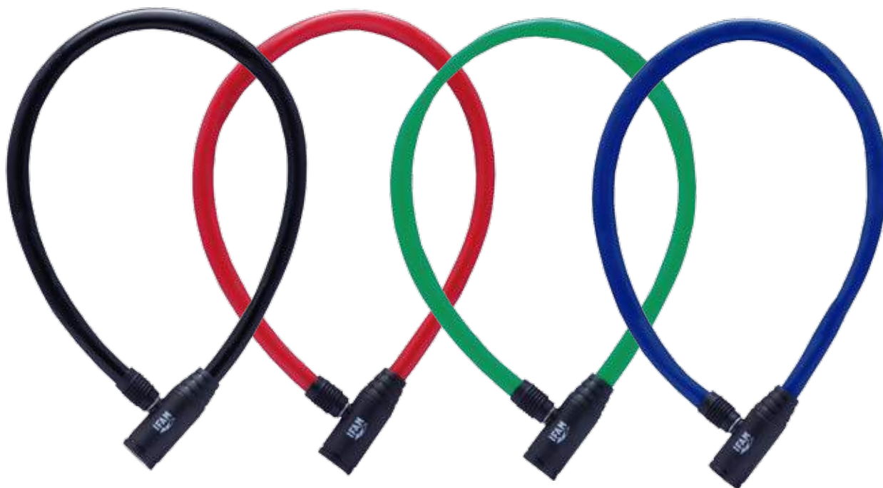
JUNIOR 50 / JUNIOR 60