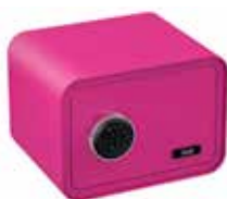
SAFESTONE 350 Opening by code