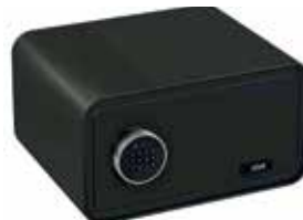
SAFESTONE 430 Opening by code