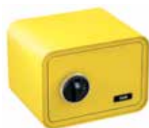
SAFESTONE 350 Fingerprint opening