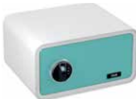
SAFESTONE 430 Fingerprint opening