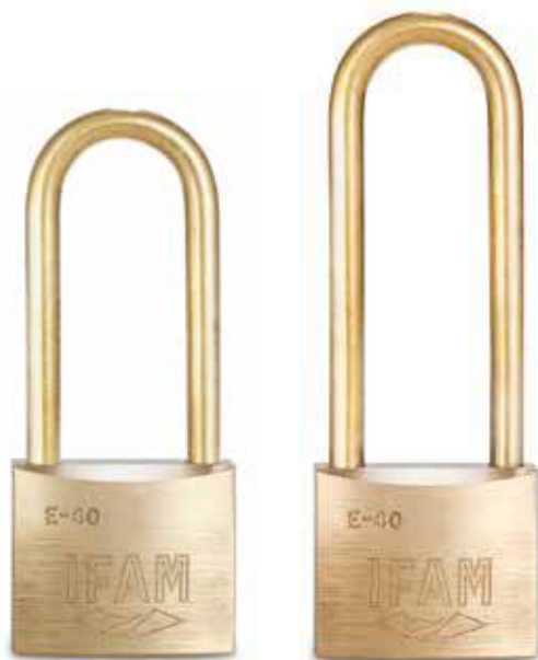
ALL BRASS 50mm SHACKLE